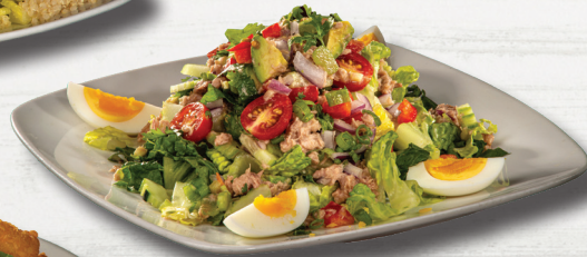
TUNA & EGG SALAD