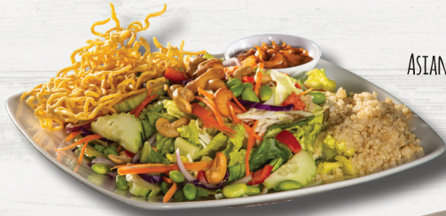
ASIAN CRUNCH SALAD