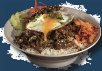
BEEF BULGOGI BOWL