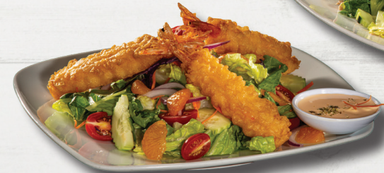
SHRIMP TEMPURA SALAD