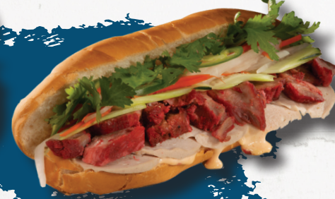
4 SEASONS BANH MI